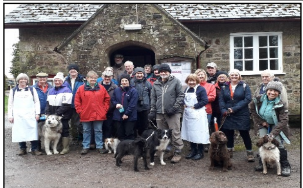
S T O O D L E I G H W A L K E R S

A recent addition to the website is a monthly Prayer Diary with a topic to pray for, each day of the month.