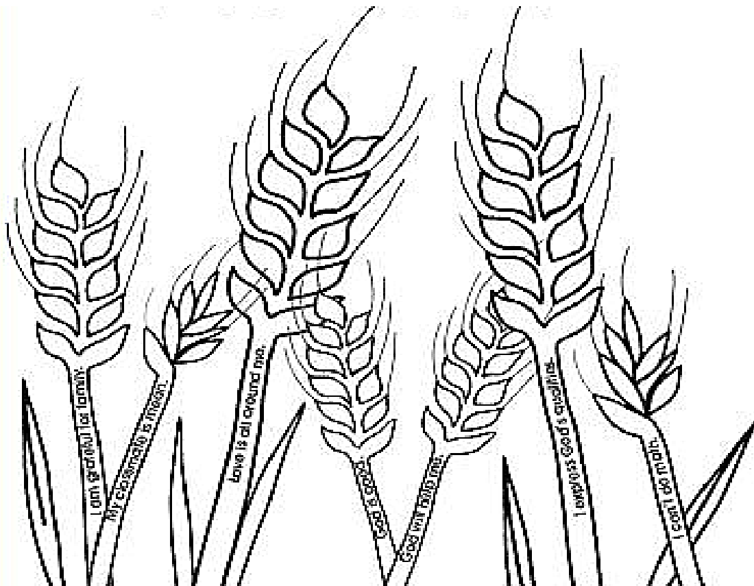
Copyright © 2017, BibleWise. All Rights Reserved. Activity by Kathryn Wojna.

Now let's harvest those thoughts! Read examples of thoughts on the stems below. Colour in the stems with good loving thoughts. Leave the unhelpful. Negative thoughts white.